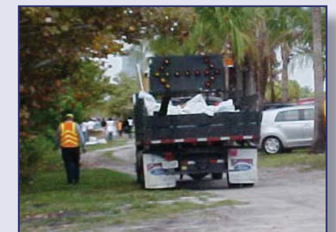
ICA crew collects bags of trash to be hauled to Dade Co. recycling and disposal facilities