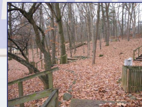
Crews bagged hundreds of 55 gallon trash bags of leaves from the grounds of one of the rest area facilities

Because of the great team effort of ICA, subcontractors and department personnel, VDOT was able to open all 19 rest areas ahead of the governor's mandated deadline.